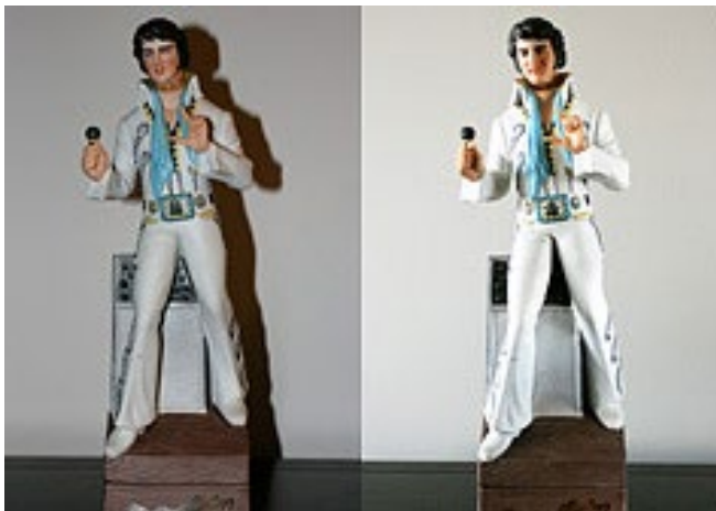
Photojojo.com, Shoot to Sell: Taking Better PHotos for eBay, Etsy & ...